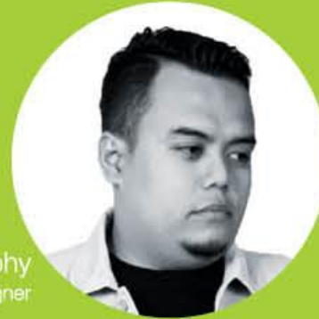
Sujaklosophy Product Designer

Creating a product design no more about an object. It's about experience. We generate a new opportunity for user to experience the brand, the emotion, the environment, the space and the ambiance. A strong commercial aspect pervaded user understanding in design and believe in good design to create a good product.