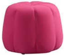
LOLLA Small H 455 W 500 BW 625