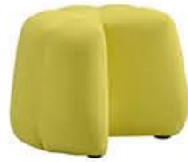
LOLLA Bite H 455 W 500 BW 625