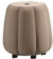
LOLLA Table with AH MEYER USB charger (optional)