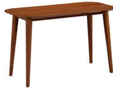
LOLLA meeting table H 750 W 1200 D 600