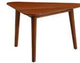
LOLLA Lounge Table H 510 D 790