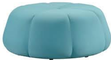
LOLLA Large H 455 W 1125 BW 1270